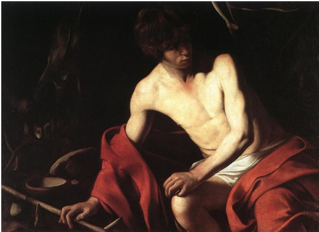
John in the wilderness, Caravaggio, c. 1604

Goal 16 is a commitment to promote peace and inclusive societies for sustainable development, provide access to justice for all, and build effective, accountable and inclusive institutions at all levels. This goal is a commitment to end violence and prevent the harm that can quickly unravel development achievements. From stopping human trafficking and conflict-related deaths to achieving more accountable government institutions and reducing corruption, achieving SDG 16 is far reaching in its ambition. While not directly addressing long standing conflicts, it aims to strengthen human rights protection including political representation and reduce illicit financial and arms flows. This goal encompasses a broad range of objectives that underpin the achievement of many of the other goals. To achieve this goal will boost achievements in the rest.